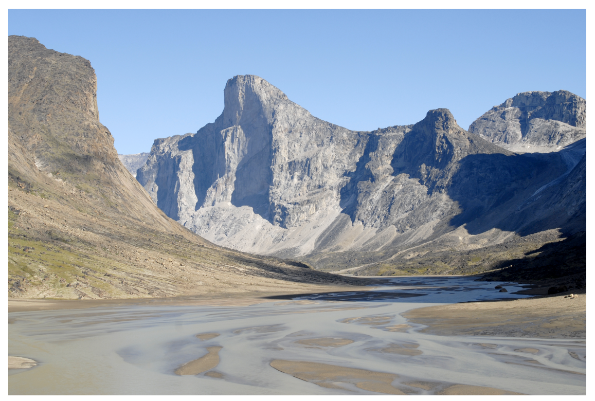
Figure 2: Mount Thor overlooking the Akshayuk Pass (photo: Nestor Lewyckyj).

http://www.lewyckyj.com/Nestor%20Rostyslaw%20Lewyckyj/Baffin%20Island%202007.htm