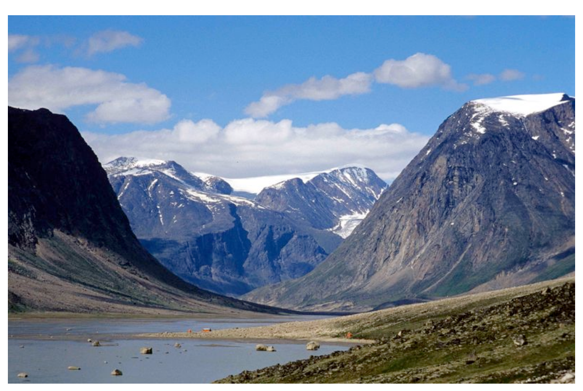
Akshayuk Pass - looking north from Pangnirtung Fiord